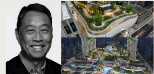
DAVID CHEN | USA PELLI CLARKE & PARTNERS