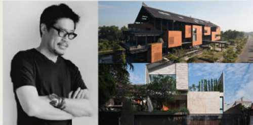
WILLIS KUSUMA | INDONESIA WILLIS KUSUMA ARCHITECTS