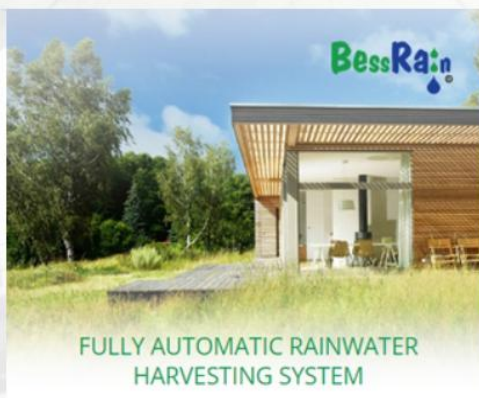
FULLY AUTOMATIC RAINWATER HARVESTING SYSTEM