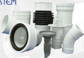
CONVENTIONAL RAINWATER DRAINAGE SYSTEM