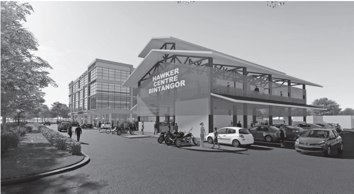
Hawker Centre, Bintangor