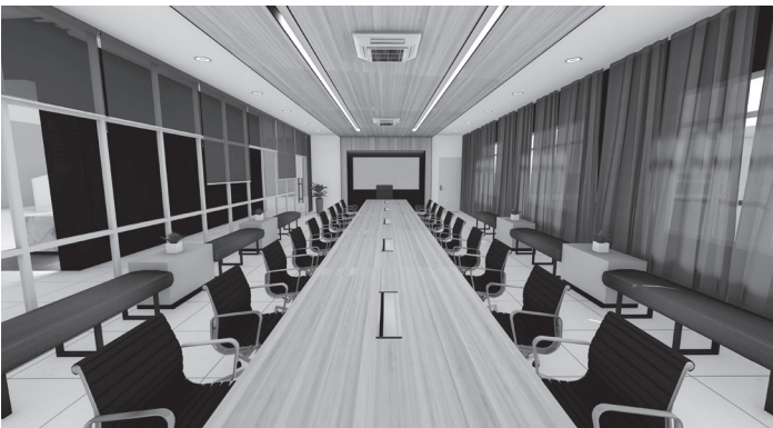
VIP Meeting Room