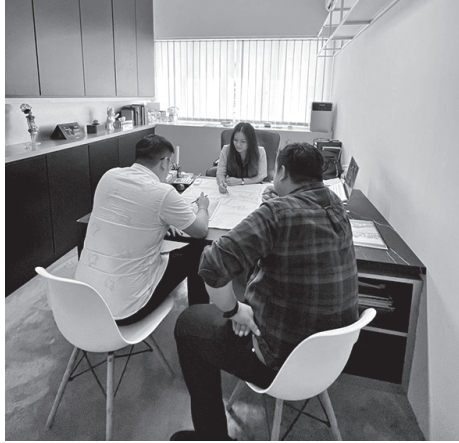
9.00am: Morning Discussion.