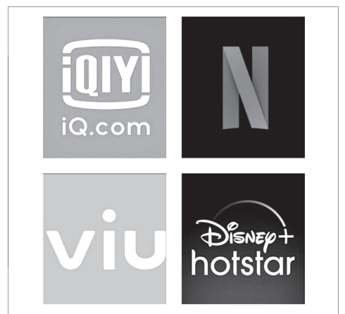
10.00pm: Me Time.