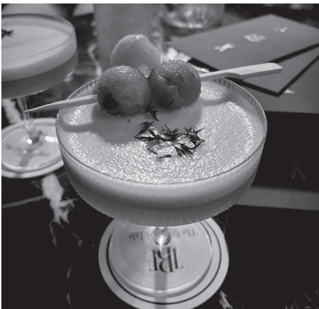
6.00pm: Chill session with friends.