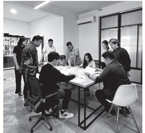
3.30pm: Group discussion with colleagues, Projects update.