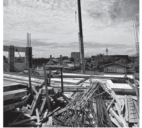
10.00am: Site visit.