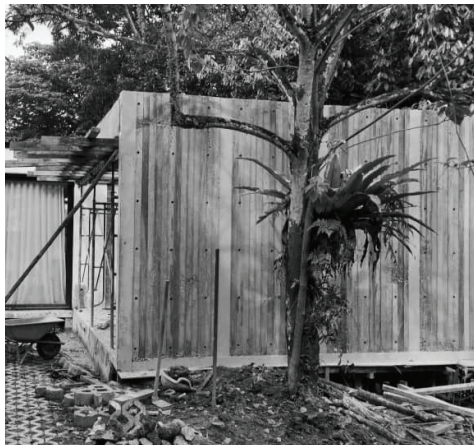
2.30 p.m. TV room extension - inspecting recently struck concrete wall.