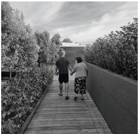
5.00 p.m. COVE 55; a trip to the seaside with mom, to check defects rectification.