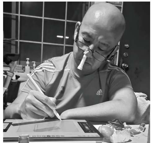
9.00 p.m. doodling after dinner, listening to Stephen Fry on Qi