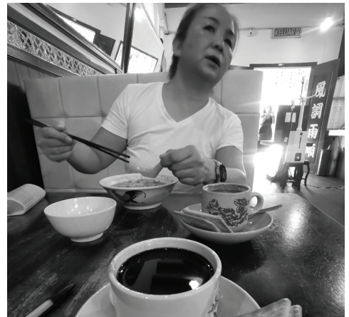
3.30 p.m. - afternoon tea with the MD.