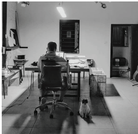
6.30 p.m. last minute tidying up before dinner, Dory stands guard.