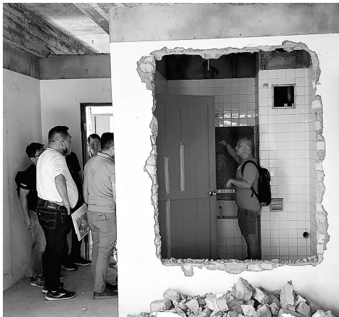
1.30 p.m. Hotel refurbishment project - site visit with sub contractors to finalise M&E routing.