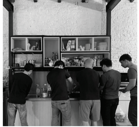
11.30 a.m. once a week we take turns to cook lunch at the office.