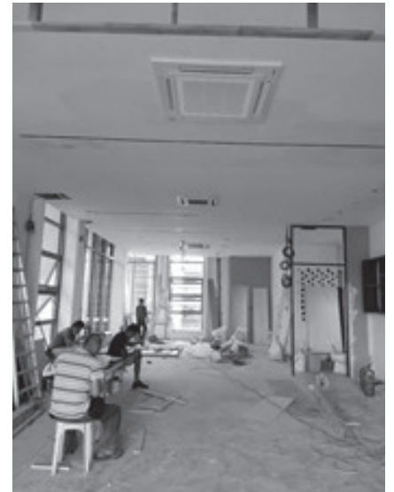
M&E WORKS - Installation of air-cond & wiring cabling above ceiling completed.