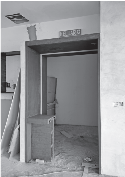
MAIN ENTRANCE - Oxidized metal door frame with delivery counter in position.