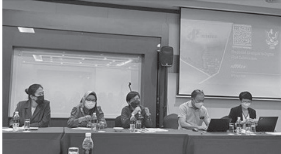
eSPA 2.0 Workshop briefing was chaired by MUDeNR & SAINS.

PAMSC will submit the feedback from members (via Google Form) on the current eSPA system officially to SAINS & MUDeNR. Members are encourage to report any technical issue or glitch to SAINS through the eSPA system support function to put all report in record for future reference.