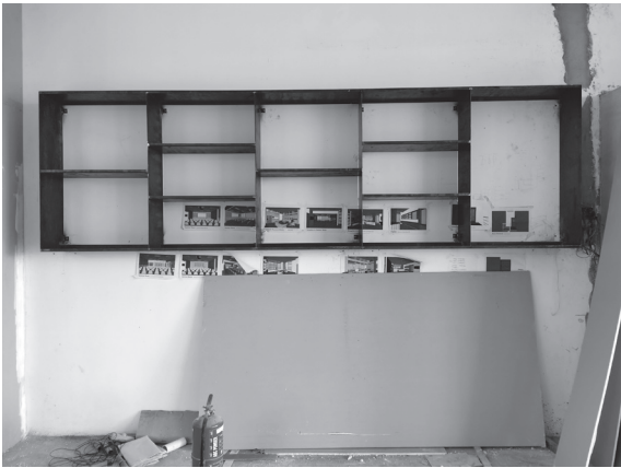
RECEPTION & LOUNGE - Mild steel shelving installed next to entrance.