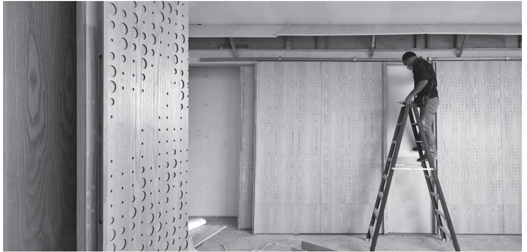
SEMINAR ROOM - Installation of plywood sliding panel with perforations motif.