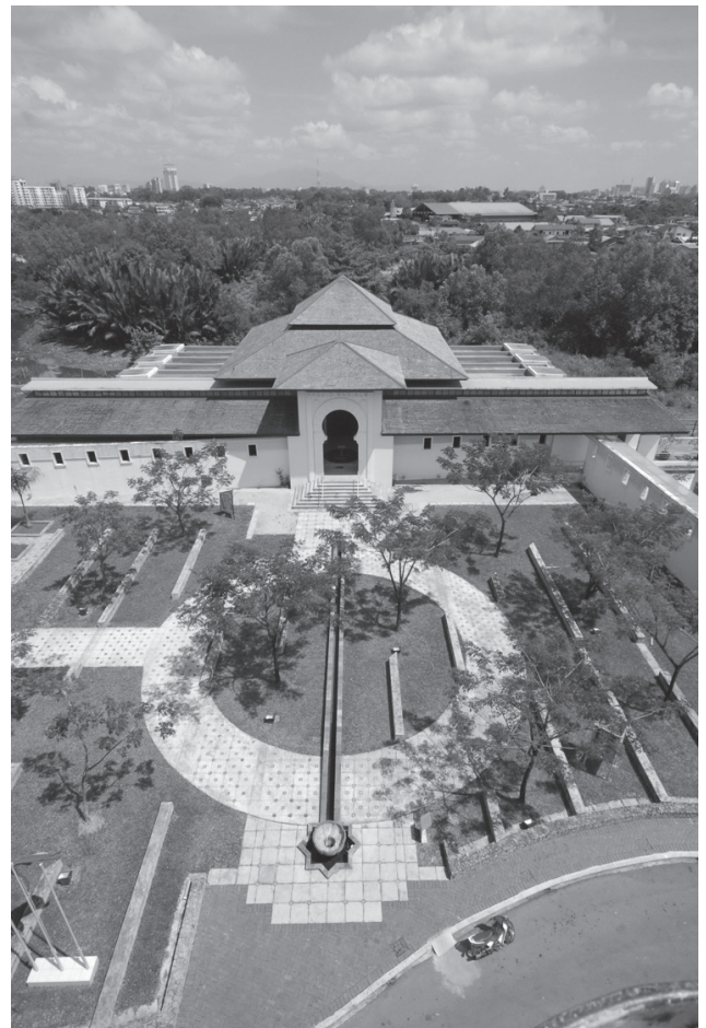
Masjid Wan Alwi - the main roof form is influenced by old mosques in South East Asia.

Now, if we did not study this out dated theories and develop an interest in it for developing our design solutions - the narrative would not be as rich and as memorable.