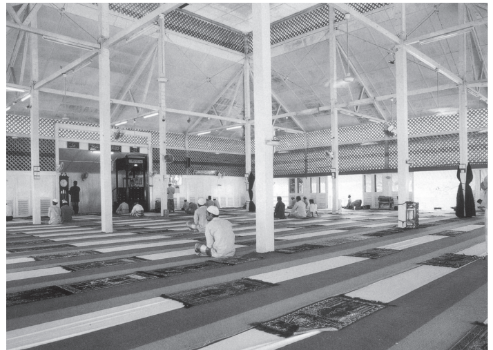
As it is built by local builders, its construction is similar to that of a kampong house; except bigger.