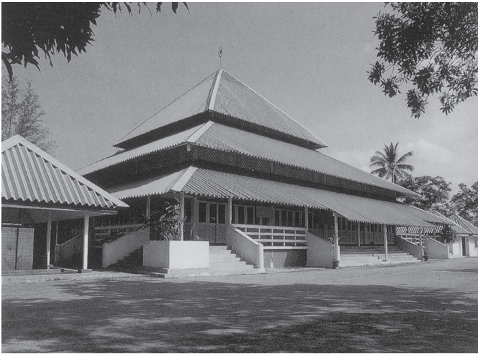
Neighbourhood mosques were traditionally built as part of a community project; using local materials and craftsmanship.