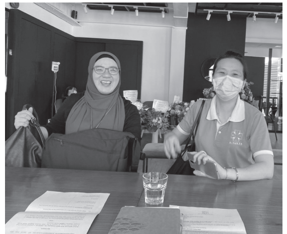
Photos taken while waiting for our take-away.