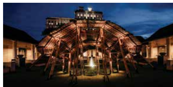
THE BAMBOO PAVILION - PG 8