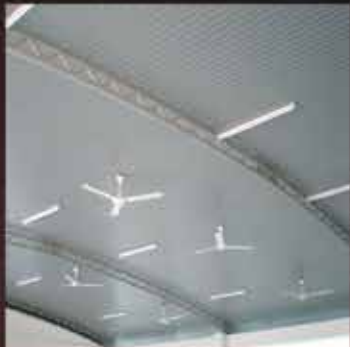
• Strip Ceiling •