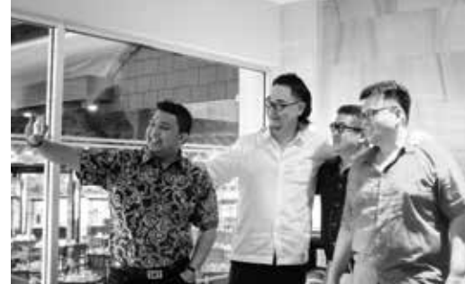
Say 'cheese' and wifie.