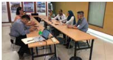
PGL Sub-Committee discussion on Fire Safety Guidelines for Long Houses on 11 th July 2019.

The PGL Sub-committee called a discussion on the 11 th July 2019 to deliberate on this matter and came out with some basic fire safety design guidelines for Long Houses. PAMSC will revert to Bomba Sarawak officially.