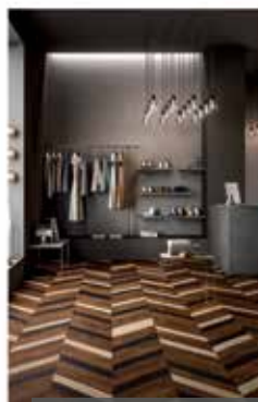
Flooring: LVT Moduleo Moods