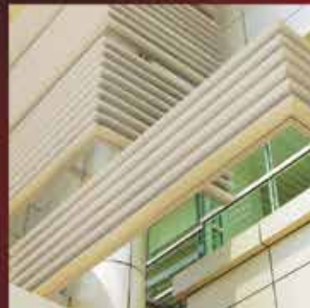
• Aeropoint •