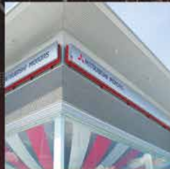
• Sun Louvres •