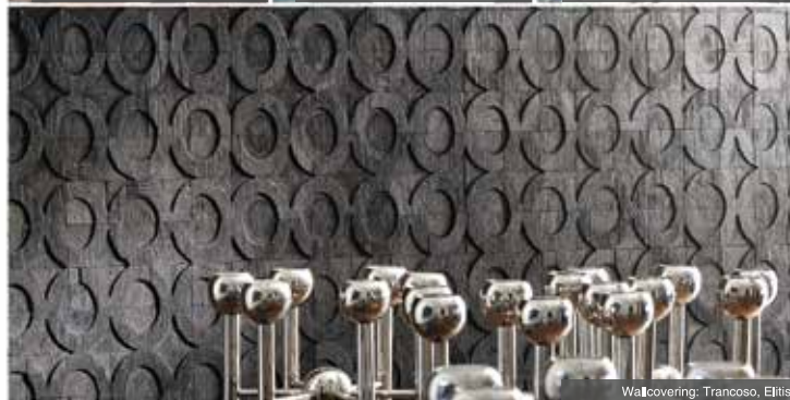
Wallcovering: Trancoso, Elitis