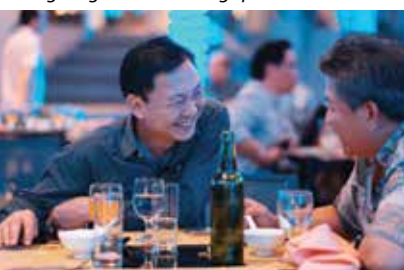
"Let's finish the Tuak."