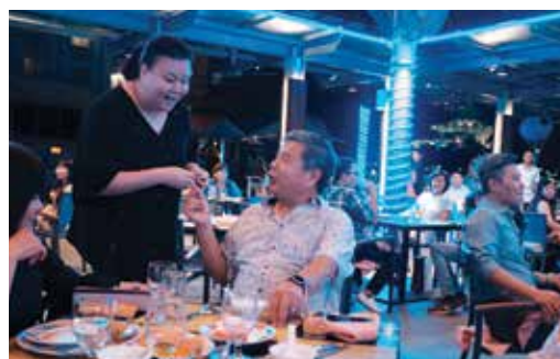
"Hi CW, how's the food?"