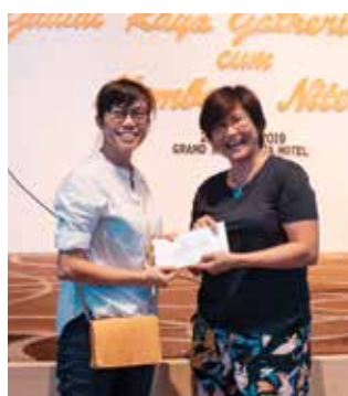
Lucky draw winners receiving their prizes.