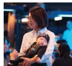
"Where is my mommy?"