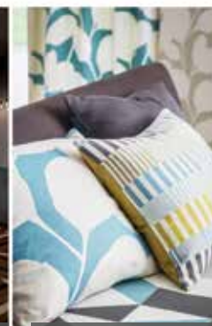
Fabric: Nuevo, Scion