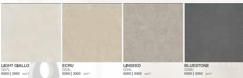
LIGHT GIALLO G57L 6060 | 3060 MATT