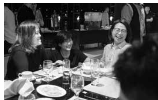
Sharing the joy.