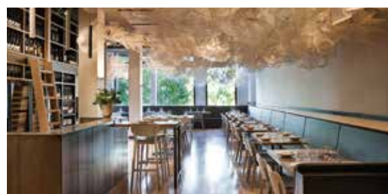
POSTCARDS FROM THE EDGE - PG 20