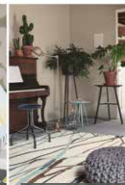
Carpet: Brink & Campman