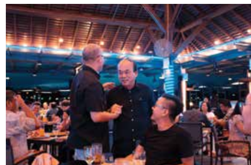
Our members mingling around with industry partners.