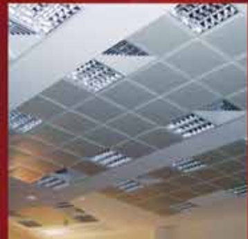
• Tile Ceiling •

DML PRODUCTS (BORNEO) SDN BHD (742099-D) (Manufacturer of Metal Ceiling and Louvers)