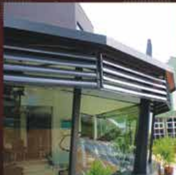
• Aerofoil •