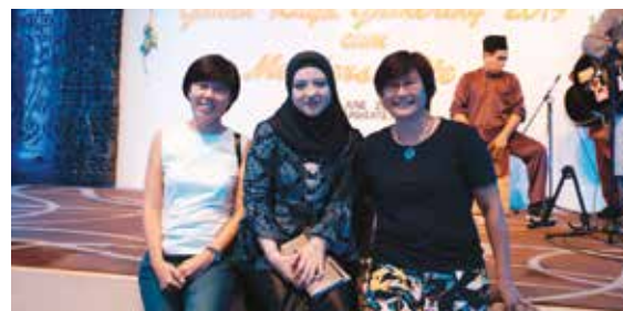
GAWAI & RAYA MEMBERS NIGHT - PG 10