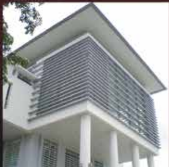
• Box Louvres •