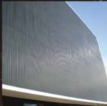
• Strip Fascade •