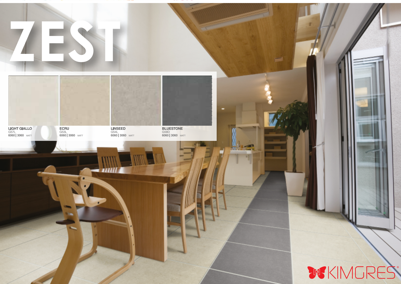
BLUESTONE G58D 6060 | 3060 MATT