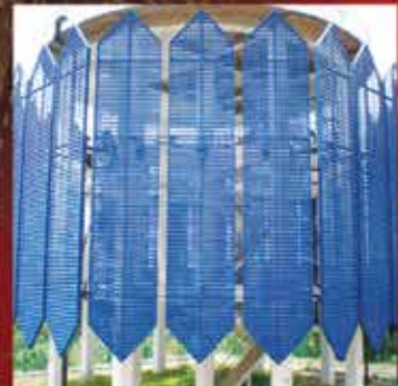
• Ventilation Louvres •